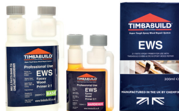
Epoxy Wood Stabiliser Packed 6 x 300ml per carton outer.

EWS primer system is a specially designed two-part low viscosity, solvent free, resin solution which is designed to strengthen weakened wood fibres by penetrating deep into the wood. The product is used as a primer in conjunction with the Timbabuild Wood Repair systems.