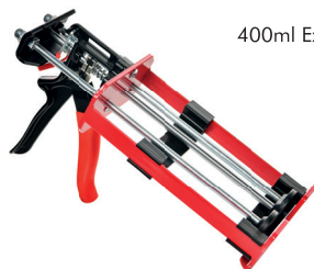
400ml Extrusion Tool

Once the damaged, decayed and discoloured wood has been removed by use of a suitable cutter tool such as a router or chisel, then the area to be treated is lightly sanded to ensure excellent adhesion. The moisture content of the wood should be no greater than 18% (check using a standard moisture meter) and damp wood should be allowed to dry naturally, or by way of a hot air gun. The two components are mixed manually into a separate container, and thoroughly agitated for one minute. The 2:1 mixing ratio should be strictly observed. EWS should be applied directly onto bare wood in the repair area using a standard brush and then left to cure for 20 minutes, prior to carrying out the repair. The repair can then be applied when the EWS is wet or fully cured. Please refer directly to the Timbabuild® EWS data sheet for more details.